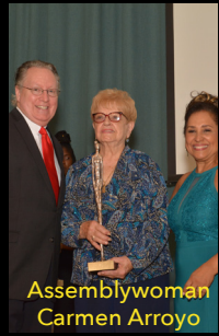
Assemblywoman Carmen Arroyo