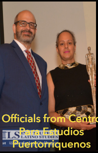
Officials from Centro Puertorriquenos