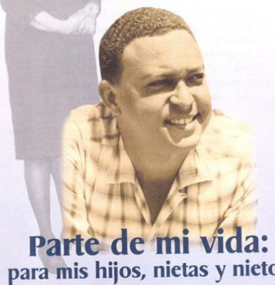
Parte de mi vida: para mis hijos, nietas y nietos