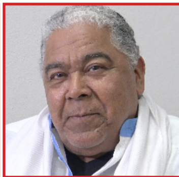
Danny Rivera Singer/Songwriter